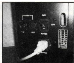
④ DMX 512: Press to DMX 512 ON/OFF