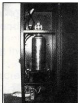
② Please using the regular liquid