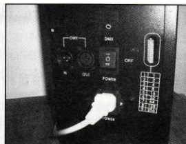
③ Power supply, Please press Power