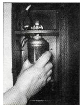
① Pack into liquid